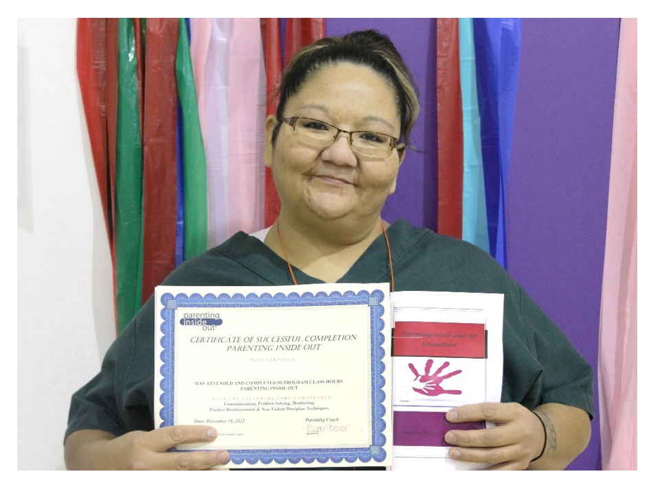
Figure 7: PIO graduation ceremony at Robert E. Ellsworth Correctional Center.