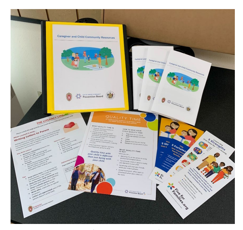
Figure 3: With the help of PIO coaches, child-focused resources are sent from incarcerated PIO participants to caregivers and children at home combined with personalized letters, drawings, and other materials. The resources come from Wisconsin partners including the Wisconsin Child Abuse and Neglect Prevention Board and The Literacy Link, a program of UW-Extension.

Shortly after completing Lesson 3.2, "Connecting through Letters, Calls, and Visits," coaches facilitate sending a resource packet to each of the caregivers and the parents' children. Resource packets include an activity sheet for one's child, activity sheets created by parents, and individualized letters, drawings, and notes. Currently, UW-Madison prints and sends the resource packets to the four participating institutions. In turn, coaches help participants add the other materials which are then sent to caregivers. This is an important way to connect what is happening in the PIO curriculum with the experiences of children at home. It can help facilitate communication and bonding, both of which can be helpful to the participating parent and child at home.