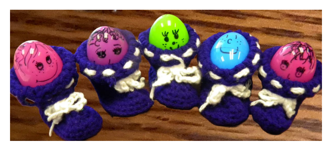
Figure 4: Eggs used in initial caretaking activity with participating parents.