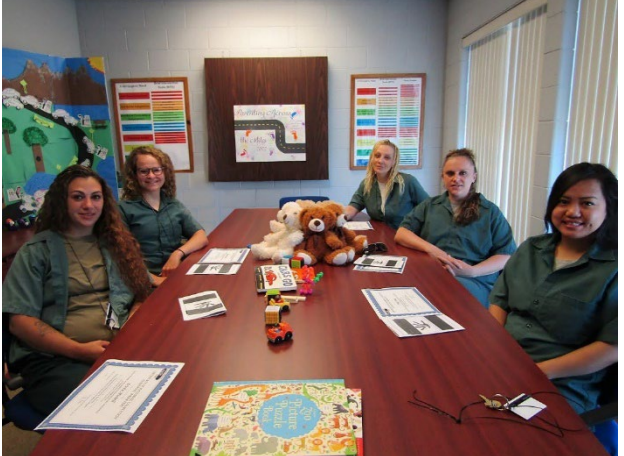
Figure 2: A mobile prop (above) used in a conference room for PIO classes at Milwaukee Women's Correctional Center.