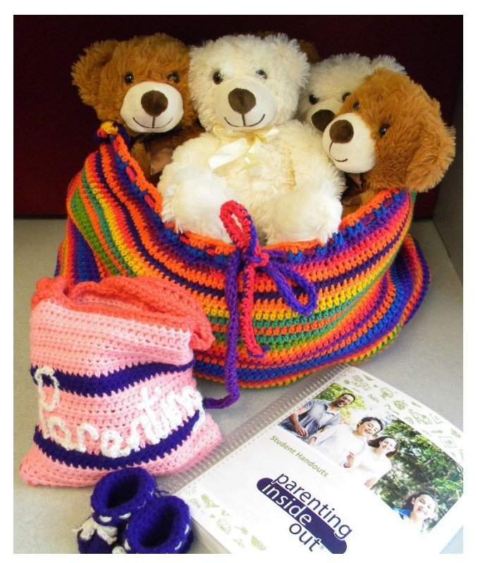
Figure 6: Teddy bears used in a caretaking activity as part of PIO lessons.

While PIO materials are designed to be appropriate for correctional institutions, some prisons may wish to review the materials to confirm that they meet all security guidelines and expectations. For instance, in higher security settings, some PIO lessons may need modification to comply with security and safety policies.