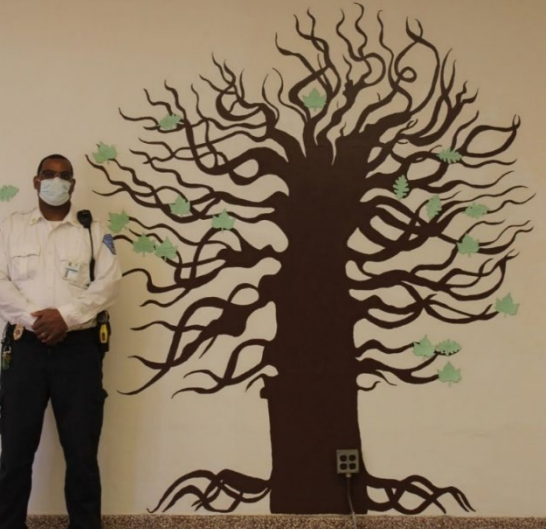
Figure 1: Permanent props painted on the wall at Green Bay Correctional Institution.